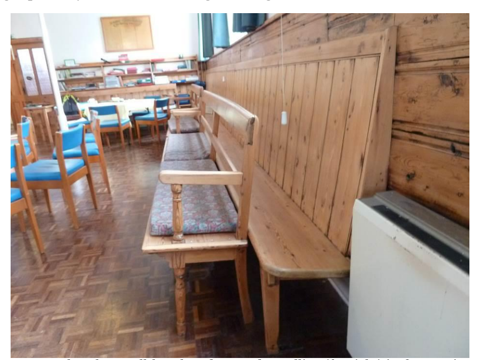
Figure 2: Loose benches, wall-bench and re-used panelling (far right) in the meeting room

Around the sides of the room are six open-backed benches with turned legs and armrest supports (figure 2). There is also an oval gate-leg table with turned legs, as well as a German-made upright piano by Baum of Eisenberg, Thüringen.